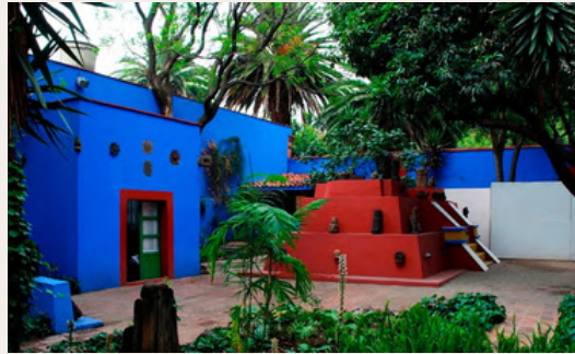
Private visits to museums