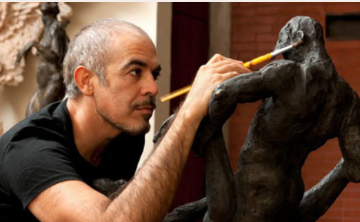
Artisanal workshops & Artist meetings