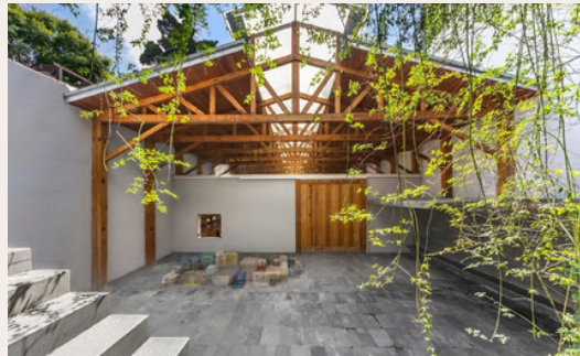
Access to Private Galleries & Boutiques