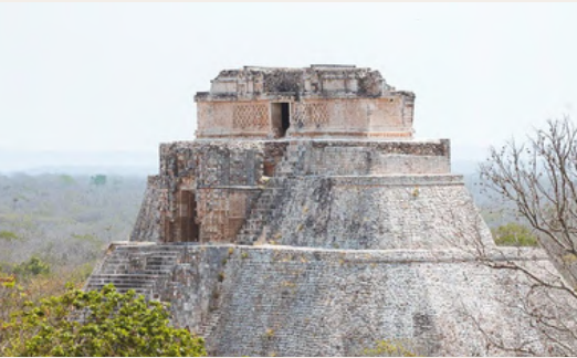
Private visits to archeological sites

Experience a tapestry of exclusive and unforgettable experiences, filled with opportunities for cultural immersion. Mexico stands as a destination where one can delve into a realm of unique and personalized encounters.