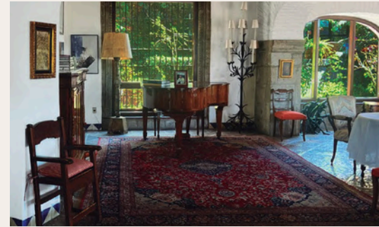
Private home experiences