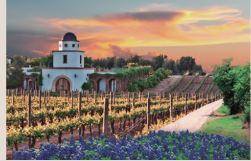
ENSENADA & VALLE DE GUADALUPE