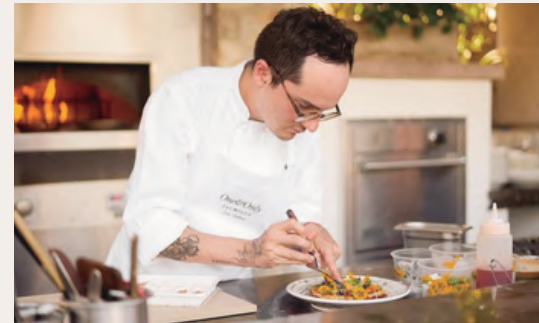
Access to culinary personalities & Restaurants