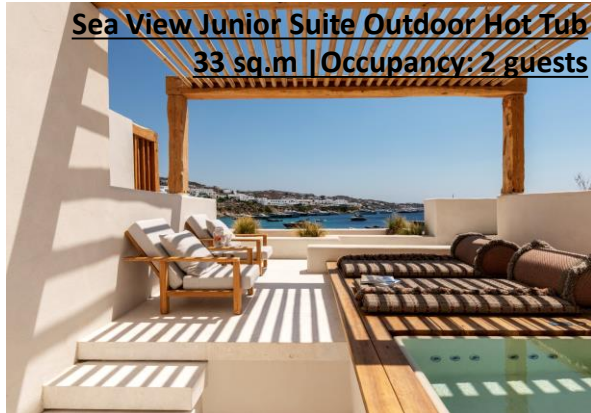
Sea View Junior Suite Outdoor Hot Tub 33 sq.m | Occupancy: 2 guests