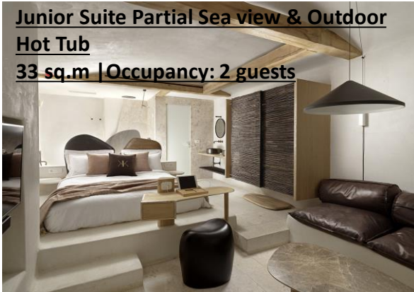
Junior Suite Partial Sea view & Outdoor Hot Tub 33 sq.m | Occupancy: 2 guests