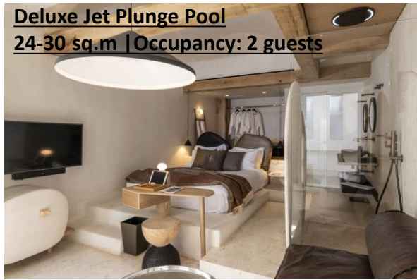
Deluxe Jet Plunge Pool 24-30 sq.m | Occupancy: 2 guests