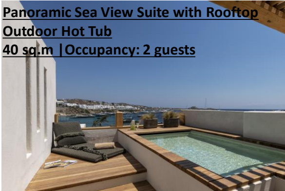
Panoramic Sea View Suite with Rooftop Outdoor Hot Tub 40 sq.m | Occupancy: 2 guests