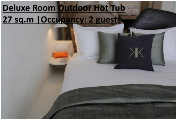
Deluxe Room Outdoor Hot Tub 27 sq.m | Occupancy: 2 guests