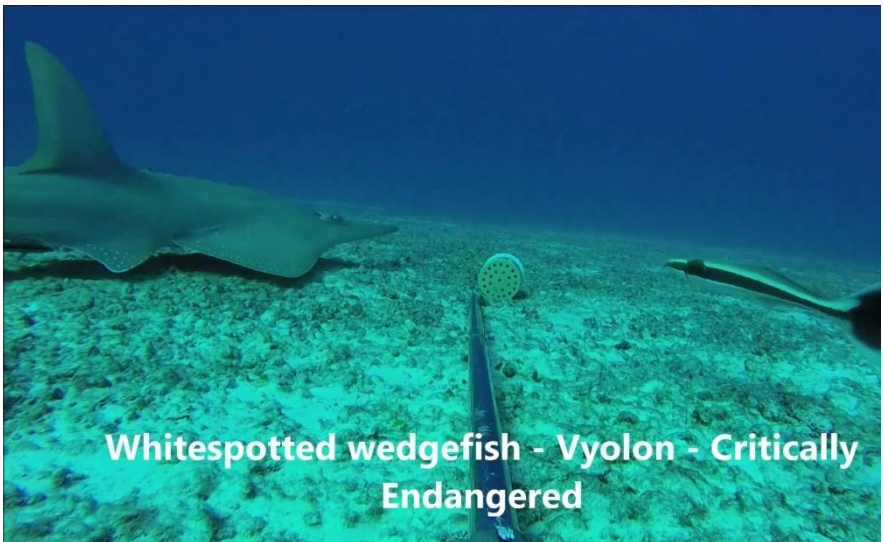
Whitespotted wedgefish - Vyolon - Critically Endangered