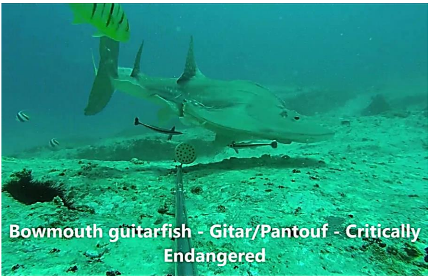
Bowmouth guitarfish - Gitar/Pantouf - Critically Endangered