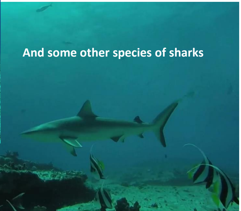
And some other species of sharks

Some pictures from the BRUVs (Baited Remote Underwater Video) deployment. There were really special discoveries here around Fregate Island Private which make our island even more important from an ecological point of view as we have found two Critically endangered species of Guitar shark living around the island.