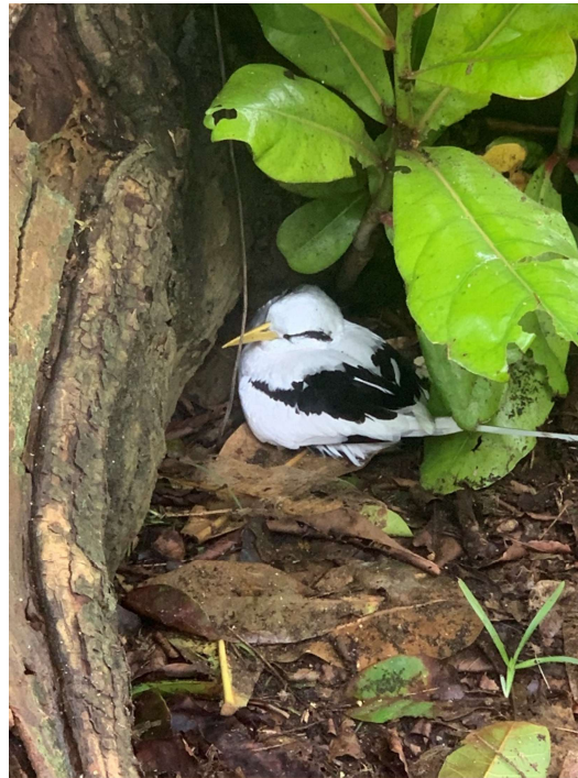
Tropic bird easy nest