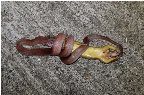
Delicious dinner for the snake a bit less fun for the lizard....